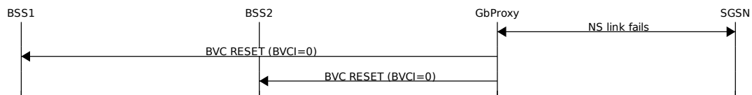
Figure 4: SGSN connection fails

If OsmoGbProxy loses the connection to the SGSN it will reset the signalling BVC of all BSS connections. This ensures that the BSS will not send traffic over a PTP BVC before its reset procedure has been completed.