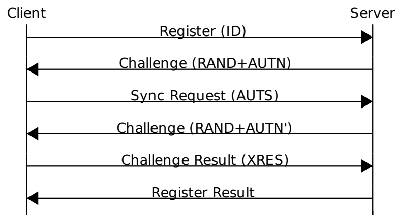
Figure 16: Variation "invalid sequence nr":