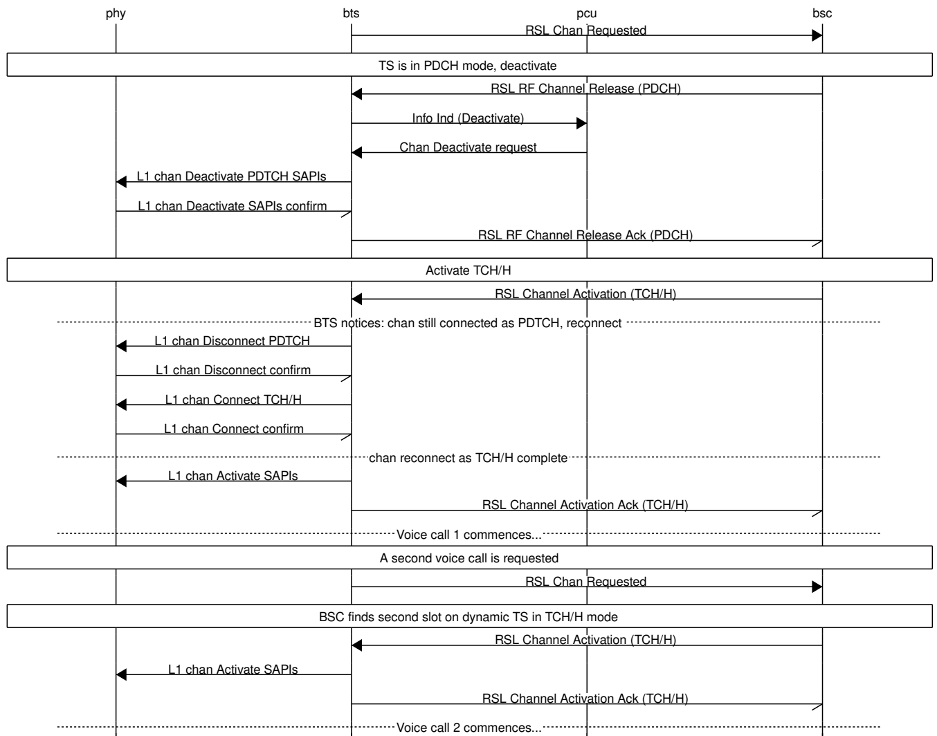
Figure 12: Part 1: example for dynamic channel switchover, for Osmocom style dynamic timeslots