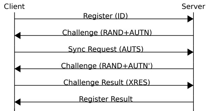
Figure 12: Variation "invalid sequence nr":