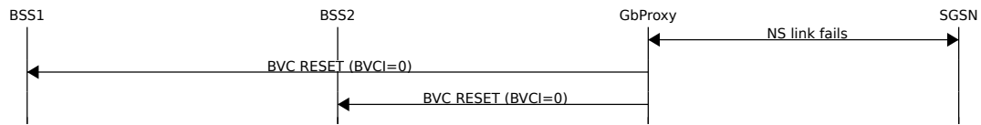
Figure 4: SGSN connection fails

If OsmoGbProxy loses the connection to the SGSN it will reset the signalling BVC of all BSS connections. This ensures that the BSS will not send traffic over a PTP BVC before its reset procedure has been completed.