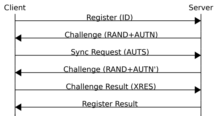
Figure 16: Variation "invalid sequence nr":